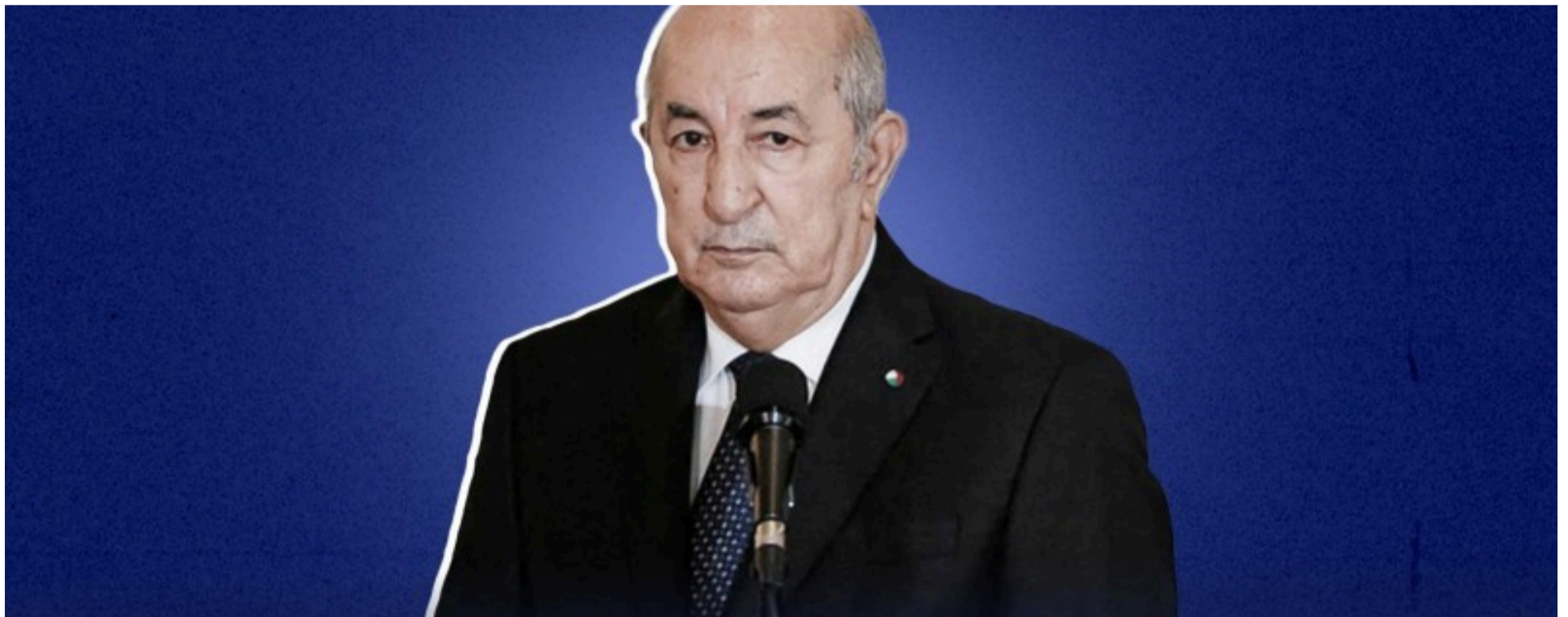
Algeria President Abdelmadjid Tebboune