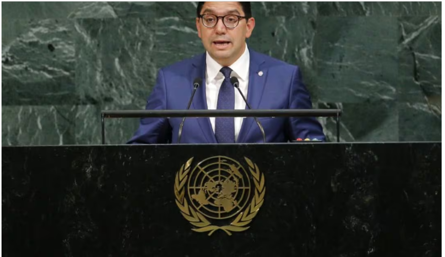
Moroccan Foreign Minister Nasser Bourita addresses the 72nd United Nations General Assembly at U.N. headquarters in New York, U.S., September 20, 2017.

UNITED NATIONS (Reuters) - Morocco was considering "all options" if the United Nations does not address its accusations that the Polisario independence movement is threatening a 1991 ceasefire in the Western Sahara conflict, the foreign minister said on Wednesday.