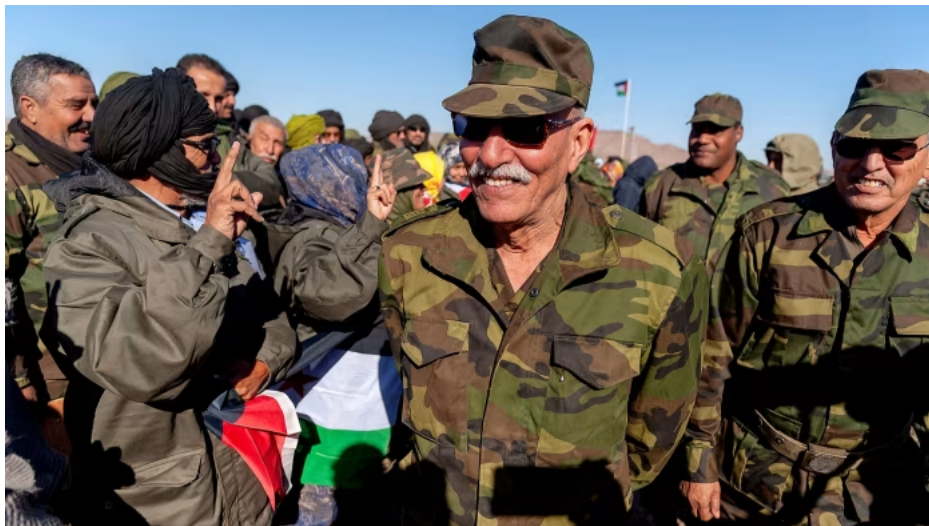
President of the Sahrawi Arab Democratic Republic (SADR) Brahim Ghali

Heba Saleh and agencies NOVEMBER 15 2020