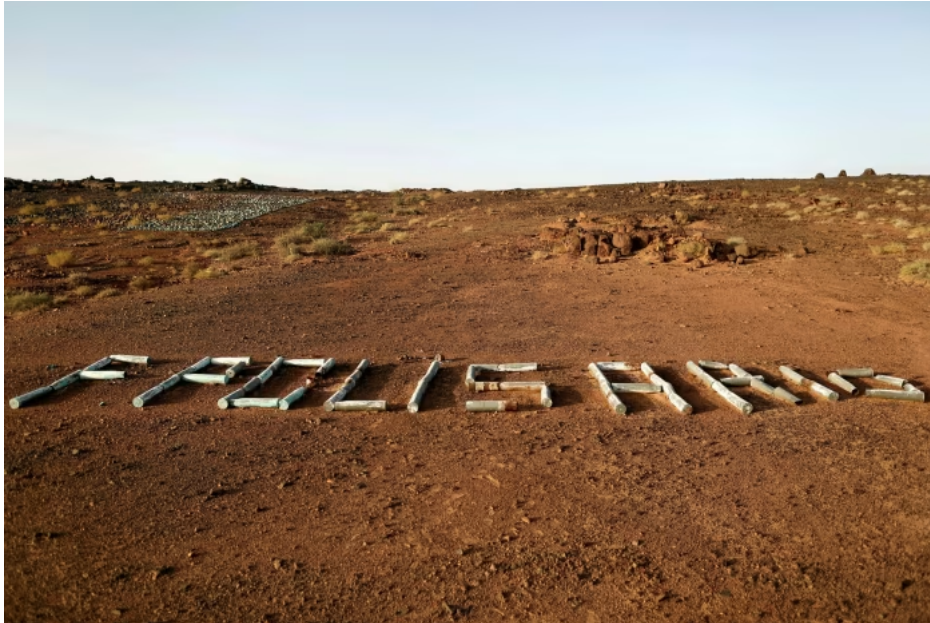
Brahim Ghali, the leader of Polisario, declared that his group had ended its commitment to the ceasefire

remote buffer region near the Guerguerat border post in the far south-west of the disputed territory close to Mauritania.