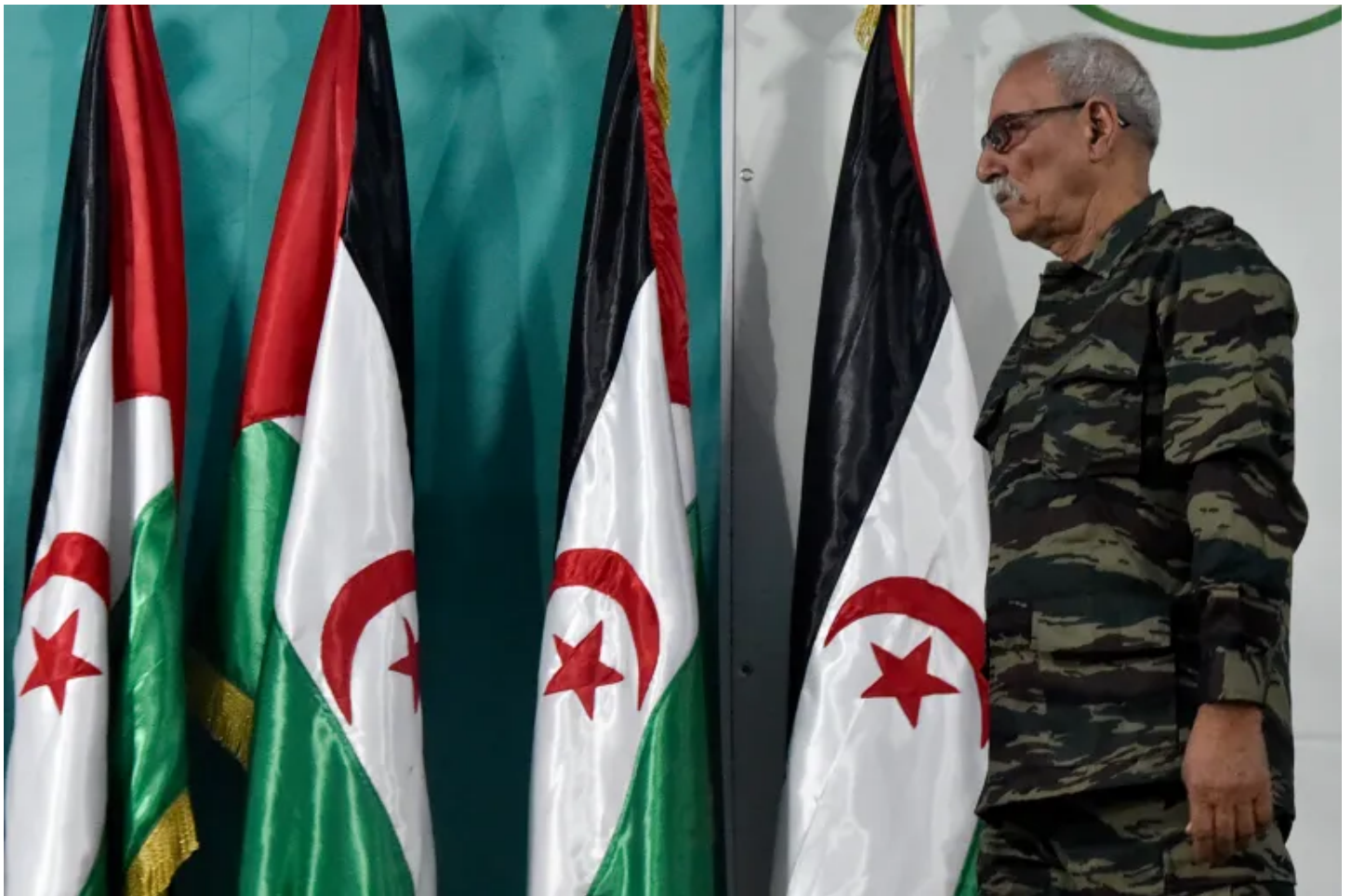
A separatist movement, backed by Algeria, has long pushed for the Western Sahara to be an independent state

Morocco claims sovereignty over territory, but other countries back separatist movement.