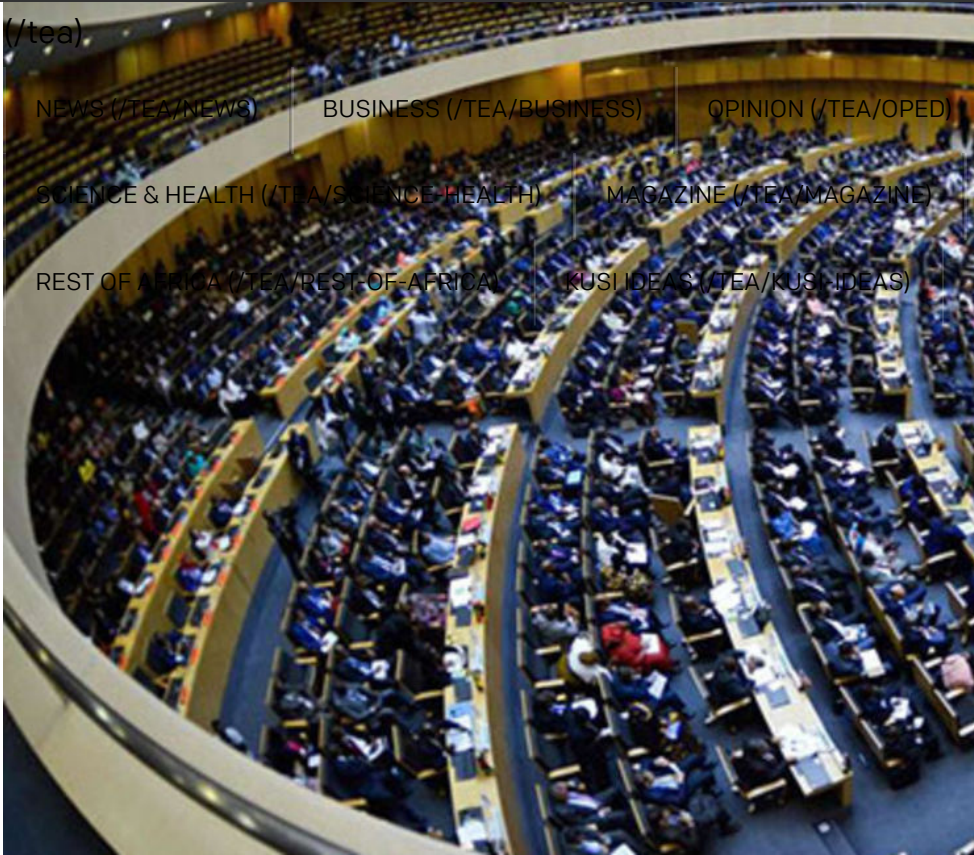
A general view of a plenary session at the African Union headquarters in Addis Ababa, Ethiopia, on November 17, 2018. As African leaders' troop into Addis for the 35th ordinary session of the African Union, the pan African organisation, faces a critical test that will make or break it.